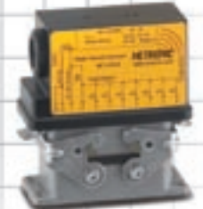
MFSHL RX-T8 Receiver