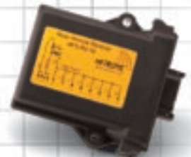
MFSHL RX-T8 Receiver