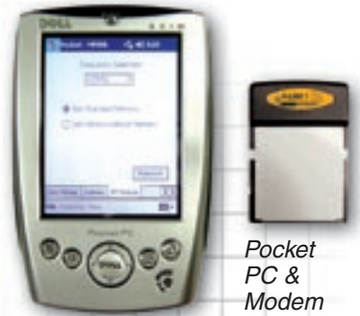
Pocket PC & Modem

The MFS feature enables up to 20 transmitters to be operated in close proximity while sharing the same frequency. Therefore, operators don't have to worry about frequency management.