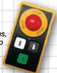
MINI V2 with two single-speed buttons, start and stop