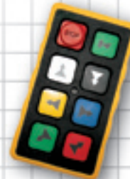
Mini V5 with 3 motions, dual-speed, start and stop button

The MINI V1 transmitter is designed as a STOP system. Up to four operators can shut down the machine or equipment simultaneously, providing maximum safety when required. The MINI remote STOP system is commonly used on direction drills and conveyor systems.